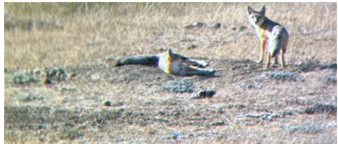
Photo above: Two swift foxes ( Vulpes velox ) (listed as "Threatened" in the Species at Risk Act), sunning and denning on the edge of a wellsite where Trace was assessing remedial options to address sodium chloride-affected soils. Twenty years earlier, this wellsite produced natural gas along with moderately salty formation water, some of which leaked onto the site. The site was decommissioned, and the salty soil was subsequently reclaimed. Fast-forward to today, and upon sighting the swift foxes while at the site, remediation was paused to consider whether it was truly needed.

this need, Trace developed a simple tool to quantify sustainability metrics quickly and economically on even the smallest projects. In this way, we have integrated sustainability considerations into our risk assessment and remediation services.