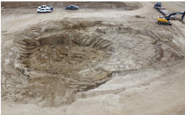
Photo above: Drone image of the final remediation extents for a former produced water pit. The final excavation soil volume of 2,000 m 3 represents approximately 5% of the total chloride extents. Remediation was on hold for several years because initial projections of site-specific guidelines did not substantially reduce liability. A second opinion yielded highly refined site-specific guidelines, saving over $4.5 million in remediation expenses and keeping 36,000 m 3 of low-risk soil from being hauled to the landfill.

Methods for selecting site-specific guidelines can be simple or complex depending on the contaminant type(s), extents, concentrations, and site-specific characteristics such as proximity to receptors, soil and groundwater characteristics, and available site-specific methods for the situation. Selecting the appropriate guideline tools and applying them to their fullest effect requires experience, training, teamwork, and perseverance. Effective site-specific guideline work often yields tremendous benefits by drastically reducing environmental financial liability and by reducing or even eliminating the need to remediate to attain site closure, all the while prioritizing protection of human health and the environment.